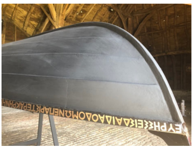
Covid Dreams Art Installation April 2021