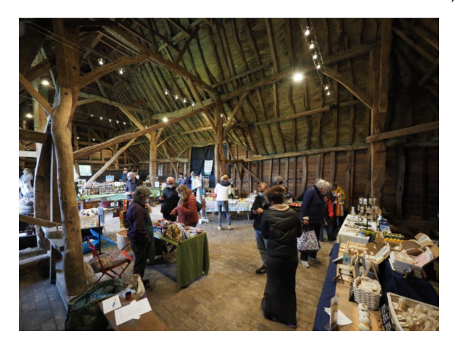
Country Market (May 2021)