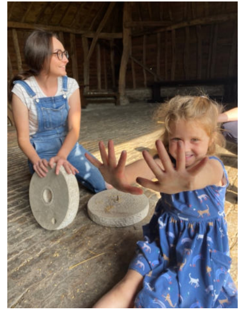
Events and learning at the Tithe Barn in 2021